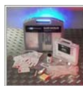
MERCURY SPILLAGE KIT