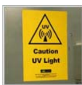
HAZARD WARNING SIGNS