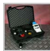
UV LIGHT METERS

For more information on the courses including dates and prices, please visit