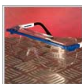
EYE & FACE PROTECTION